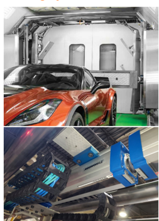
The Movopart units attach to the system's stepper motors via Thomson RediMount™ motor mounting adapter kits, which enable seamless installation in only a few minutes.

Click below to read the full article and learn how three Thomson Movopart linear units are answering U.S. Autocure's call for customized design requirements and safe, smooth and quiet movement of their system's overhead and side IR heat lamps.